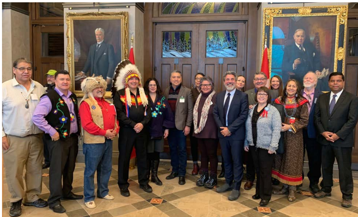
Group photo after Minister Rodriguez announced the Indigenous Languages Bill at the House of Common Gallery

http://www.metisnation.ca/wp-content/uploads/2019/02/Indigenous-Languages-Bill.pdf