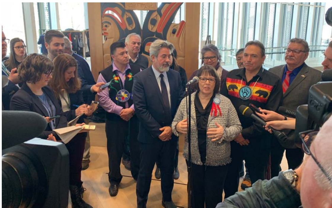
Photo: Minister Morin Dal Col (center) addresses the media on Indigenous Languages Bill, Minister Rodriguez (left), and AFN NC Bellegarde (right)

February 5, 2019 (Ottawa, ON) – The Métis Nation welcomes the legislation introduced today in the House of Commons and the effect it will have on the protection and promotion of the Michif language, the national language of the Métis people and Nation.